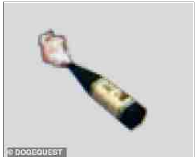
The site uses an image of a Molotov cocktail as its cursor

There have also been more than a dozen acts of vandalism against Tesla vehicles, dealerships and charging stations since Donald Trump's inauguration, according to police and local reports.